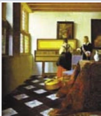
Vermeer's The Music Lesson

Admission: $5 for workshop participants, $10 for all others.