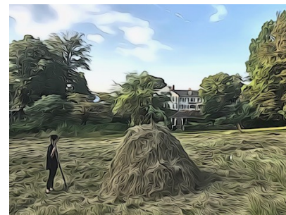
By Gay Ayers