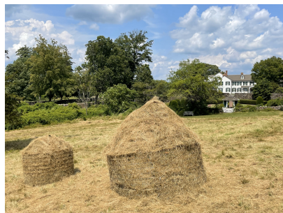
Sheep Meadow at Hill-Stead Museum